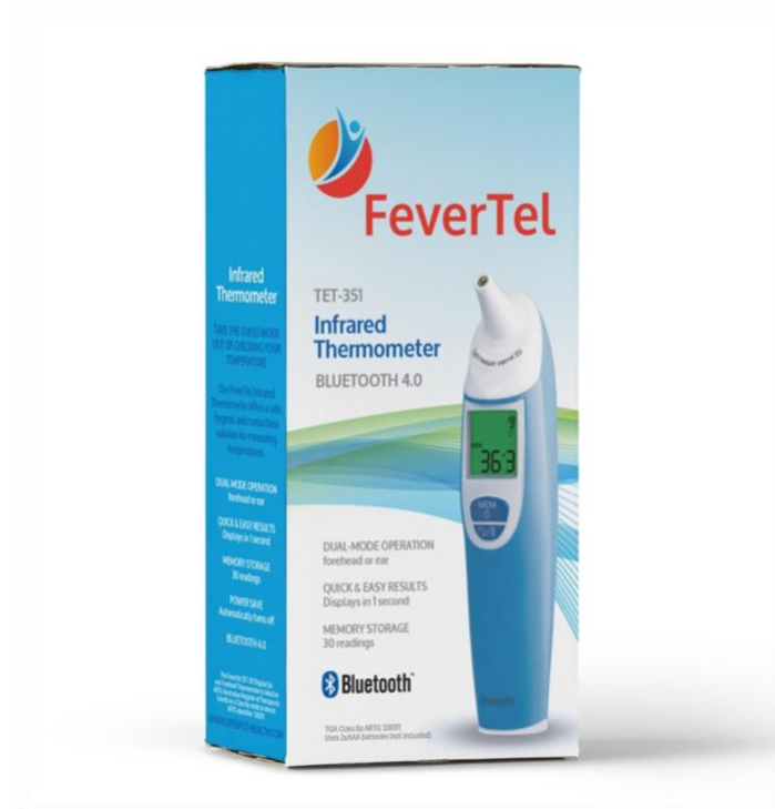
FeverTel™ dual mode infrared thermometer

The Company's FeverTel™ Digital Thermometer and APP allows families and small organisations of up to 10 people to track their body temperature and Flu / COVID symptoms via the FeverTel™ APP and Bluetooth connected dual mode digital thermometer.